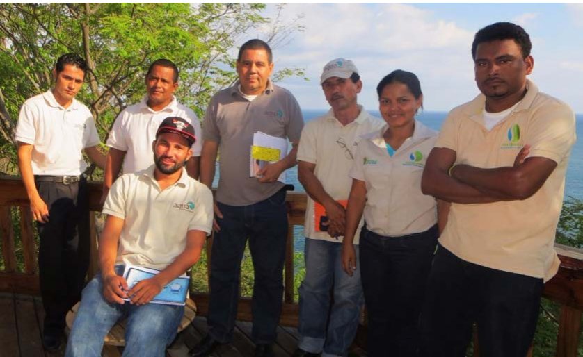
Members of the Aqua Wellness Resort team pose with Paso Pacifico sea turtle rangers.